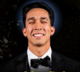
Oswaldo Cabrera MLB Player CRF Heroes Award