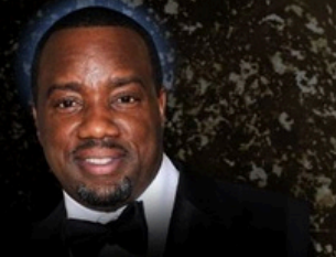
Malik Yoba CRF Board Member, Actor, Filmmaker, Entrepreneur