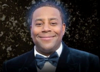
Kenan Thompson CRF Board Member, Actor

RED CARPET & COCKTAIL HOUR 6:30-8:00P | DINNER 8:30P | BLACK TIE ATTIRE THE EVENINGS HOSTS