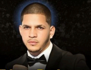
Edgar Berlanga CRF Board Member & Professional Boxer CRF Service & Dedication Award