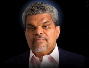
Luis Guzman CRF Board Member, Actor